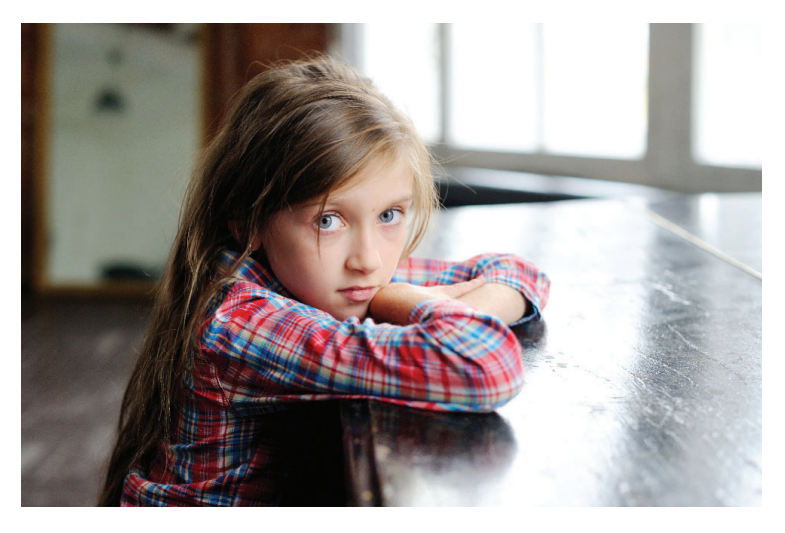
Your gift will provide a local child with a new backpack full of the essential school supplies they need to return to school ready to learn.

Your donation will provide a child with a brand new backpack filled with pens, pencils,